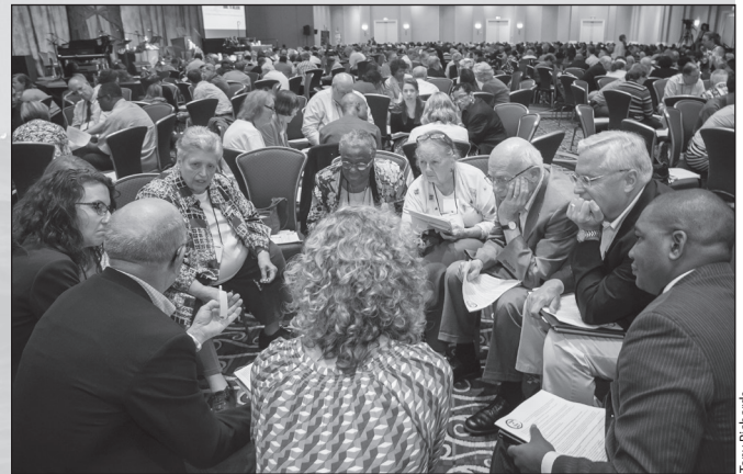
Conference members participate in the Circles of Grace Thursday night.

Results of the voting were expected to be announced Friday morning.